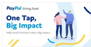
One Tap Big Impact Twitter image option 1.jpg