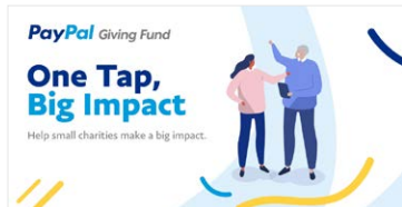
One Tap Big Impact LinkedIn image option 1.jpg