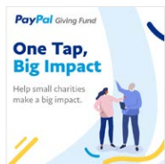
One Tap Big Impact Facebook image option 1.jpg