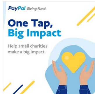
One Tap Big Impact Instagram image option 2.jpg