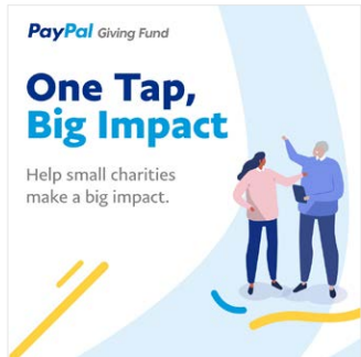
One Tap Big Impact Instagram image option 1.jpg