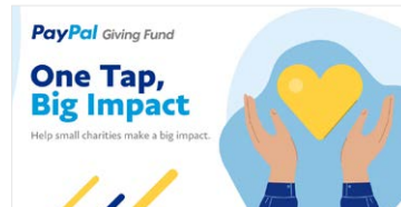
One Tap Big Impact LinkedIn image option 2.jpg