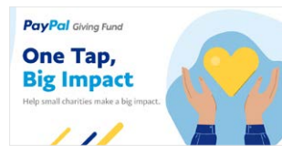
One Tap Big Impact Twitter image option 2.jpg