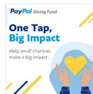
One Tap Big Impact Facebook image option 2.jpg