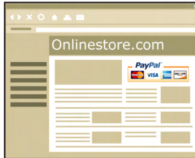
PayPal solution graphic on a homepage

The PayPal solution graphic should be used on your website's homepage to communicate to your customers that you accept PayPal payments. We realize that there are needs for both horizontally formatted graphics and for vertical applications. The vertical graphic was created for use in side columns.