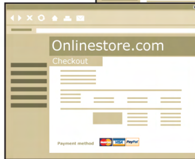
The PayPal acceptance mark in a checkout