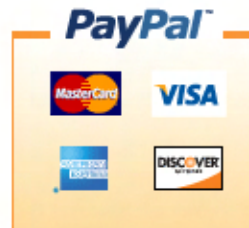
PayPal solution vertical graphic