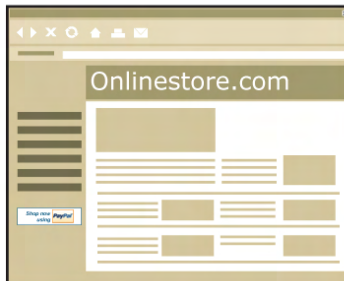
PayPal graphic on homepage

The PayPal preference graphics were designed to be used in side column spaces, but can be used anywhere on your site that suits your needs. We've designed two different styles for you to choose from. One image and message may not work for everyone.